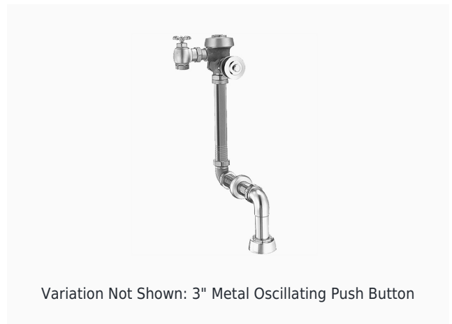
Variation Not Shown: 3" Metal Oscillating Push Button