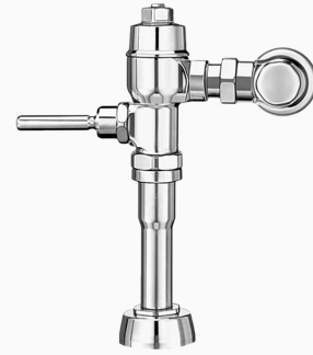
Variation Not Shown: Less Vacuum Breaker