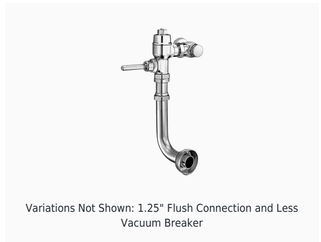
Variations Not Shown: 1.25" Flush Connection and Less Vacuum Breaker