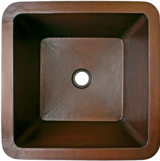
Shown in DB