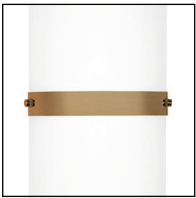
VB - Vintage Brass