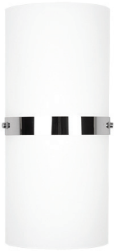
CH - Chrome