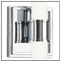
CH - Chrome