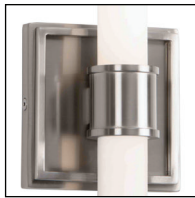
BN - Brushed Nickel