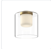
FM53509-BG/CL Brushed Gold/Clear