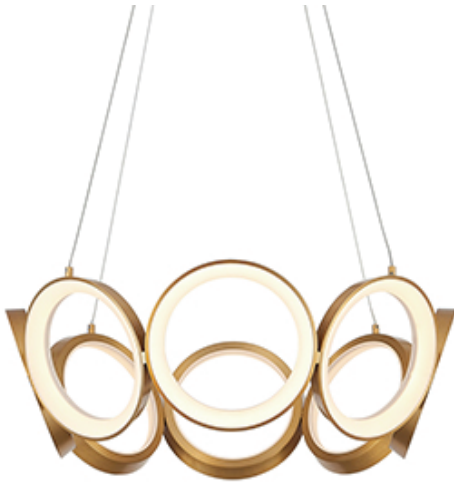
AN - Antique Brass