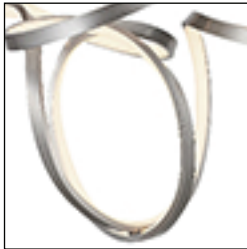
AS - Antique Silver