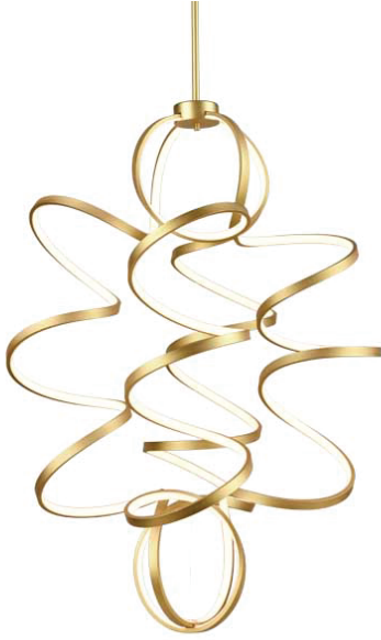
AN - Antique Brass