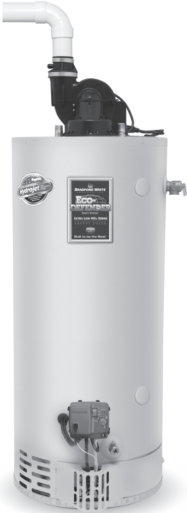
Photo is of ULG2PV50H563N